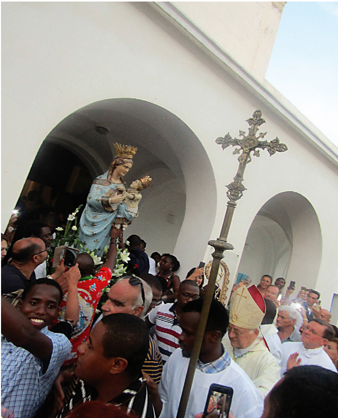
Image 6.2: The 2017 procession of the Virgin Mary of Trapani in La Goulette, that has revived in the town after 55 years of prohibition. In the foreground, sub-Saharan African men are carrying the Marian statue, in order to confirm the leading position of subaltern people. The bishop and other persons of the clergy, Tunisian and European people, Catholic, Muslim, Jews and atheists, are participating together.

In dialogue with the new pluralist constellation of the city, Paolo of Collettivo FX decided to break from tradition and represented the Virgin in a new way, as the defender of migrants: in the painting they would be represented under the coat of Mary, to be protected against their own passports and documents that are ‘raining’ (see Image 6.1 ). Immigrant people strongly demand ‘the rain of documents,’ because