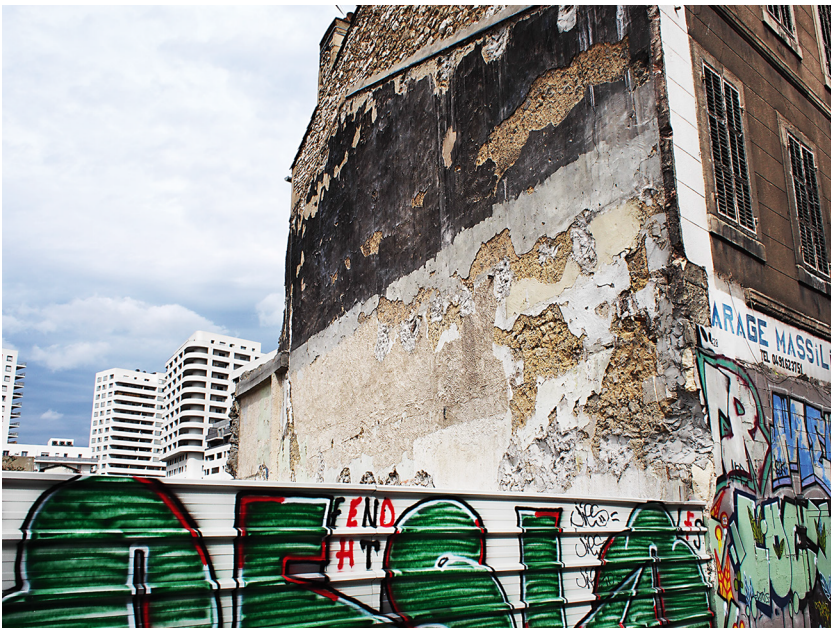
Image 5.3: Demolition and reconstruction, north Boulevard National.

If the student accommodation over this eatery has been labelled with the ‘Euro-Mediterranean’ nomenclature, the minimalist décor