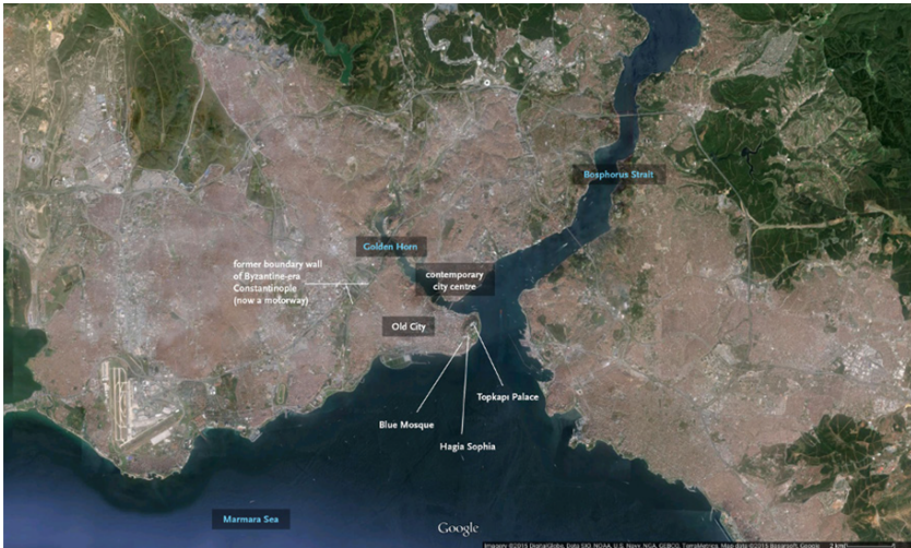
Image 8.1: Satellite image of Istanbul. Sultanahmet is located at the tip of the Old City peninsula, whose boundaries correspond to those of Byzantine-era Constantinople. The city's unique geography, concentrated around three converging peninsulas, helps make the phenomenon of multiple urban centres that do not interact with one another plausible.

cally as teens, whereupon they gravitate toward the district of Sultanahmet at the heart of Istanbul's Old City (see Image 8.1 ). With Turkey consistently ranked among the most visited destinations worldwide, 4 this choice of positioning at the inside–outside frontier via international tourism – where the world comes to them rather than the other way around – is as near as they can get to freedom of movement in the near term, since Turkish citizens are subject to strict visa regulations for travel to most countries. This we can think of as an adaptation in the nation-state era to the trajectories of the garip yiğitler (plural), who roamed the 'borderless' Ottoman Empire. After a period of adventure, though, the impinging quality of the normative gaze eventually creeps back into their awareness. They sense that their aspirational subjectivities are misunderstood and/or looked down upon by other Istanbul residents, and they come to believe they will not ultimately be able to lead the lives they imagine for themselves if they remain in Turkey. By this point, however, having intentionally not maintained the