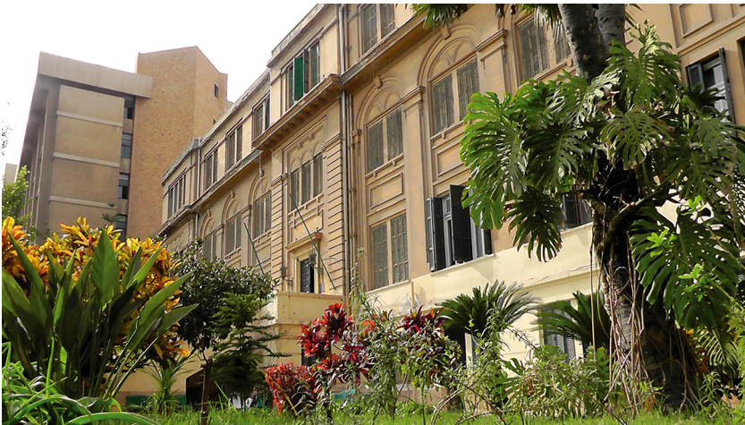
Image 1.1: Casa di Riposo Vittorio Emanuele III, Alexandria, Egypt.

In Alexandria, Egypt, tucked behind the Bibliotheca Alexandrina, across from the Greek school campus, and next to the old tram line, there is an Italian care home (Casa di Riposo, see Image 1.1 ). The home was built in 1928 to house over 200 elderly or disabled Italians and then expanded several years later when there was need for additional rooms. At the time, there were over 30,000 Italian residents in Alexandria (out of around 55,000 in all of Egypt). When inaugurated, the Italian architects, charity organisations, and diplomats dedicated the Casa di Riposo to Mussolini and named it after the then king, Vittorio Emanuele III. In 1946, after the collapse of the Fascist govern-