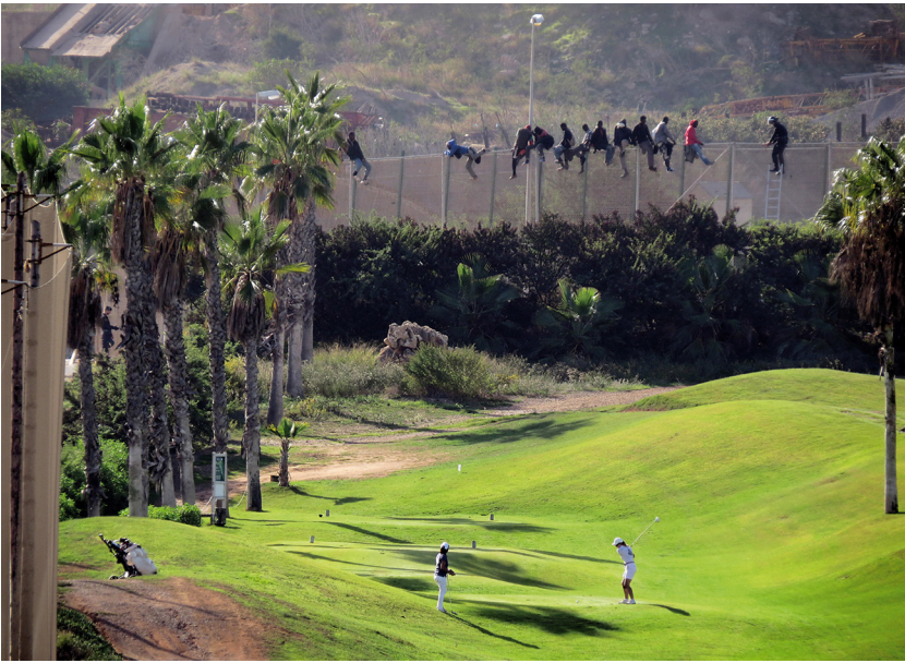
Image 3.1: Migrants climbing over the border fence while two Melillans play golf.

Photo: José Palazón. Released under CC BY-SA 4.0.