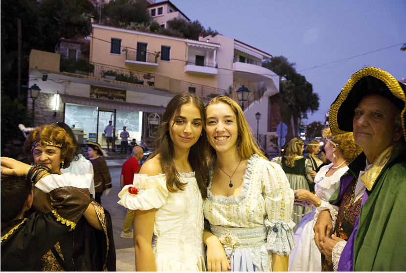
Image 4.1: Members of Nafpaktos' annual parade, dressed as members of the Holy League.