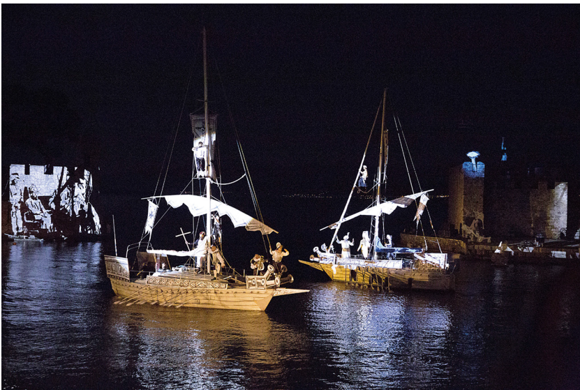
Image 4.2: The re-enactment of the Battle of Lepanto in Nafpaktos' harbour.

On Saturday, 5 October 2019, the fortress of Nafpaktos stood against a magnificent cloudy landscape. Some appeared concerned by the weather. ‘If it rains the celebration will fail... All this money, all in vain,’ I overheard a lady whispering to herself. Equipped with loudspeakers, headlights, and projectors, the port would serve as a theatrical scenery, and the grey tones in which it was embroiled made it all the more dramatic. By noon the boats and yachts moored at the port had sailed and only two remained. The one to the west was adorned with banners carrying Jesus Christ. The one to the east carried stars and crescents. By early afternoon, the main square was packed with people and street vendors, selling balloons and cotton candy. I made my way to the harbour to secure a good spot. Soon the two fleets would confront one another against a storm of fireworks and applause (see Image 4.2 ).